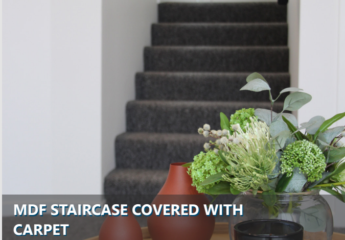
MDF STAIRCASE COVERED WITH CARPET