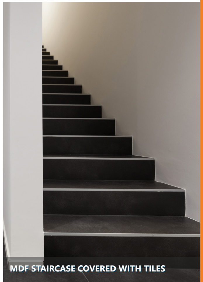
MDF STAIRCASE COVERED WITH TILES

6 More POWERFUL Reasons Why Impressive Stairs Must Be Your Preferred Supplier of Choice!