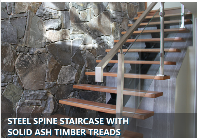
STEEL SPINE STAIRCASE WITH SOLID ASH TIMBER TREADS