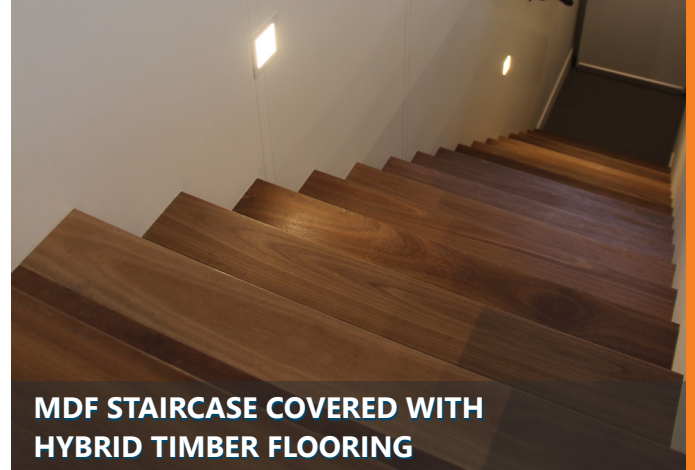
MDF STAIRCASE COVERED WITH HYBRID TIMBER FLOORING